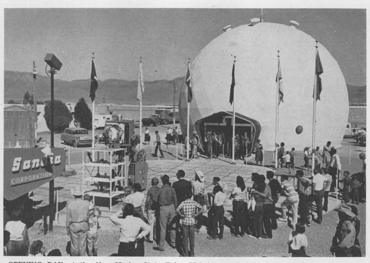
OPENING DAY at the New Mexico State Fair found crowds attracted to the Sandia "Sphere of Science" exhibit. Shown above watching Sandy